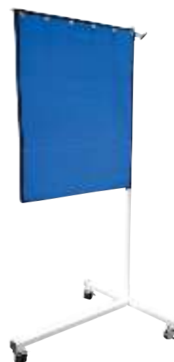
Deluxe Mobile Lead Shield on T-Base

For more information call +44 2890 381 481 (NI) or +353 1 295 0500 (ROI) or email sales@hsl.ie