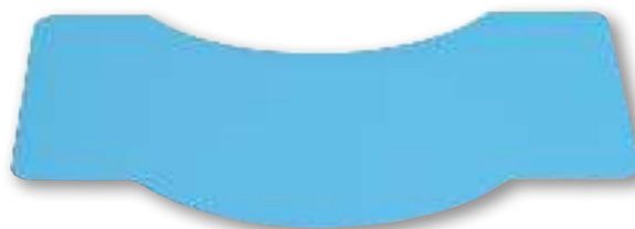
Grayshield Eye Covers