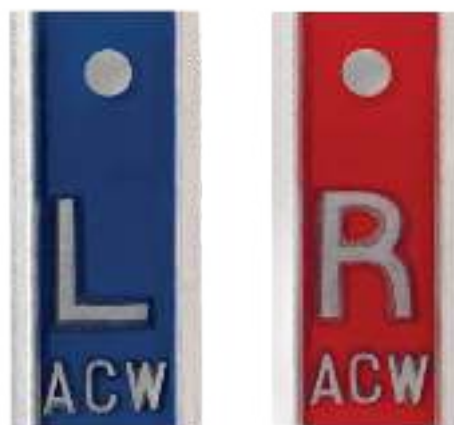
Lead Markers: Available with additional lettering