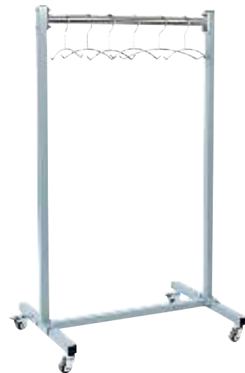
Mobile Bar Apron Rack