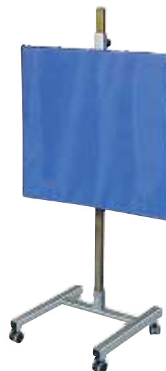
Max Mobile Lead Shield with H-Base