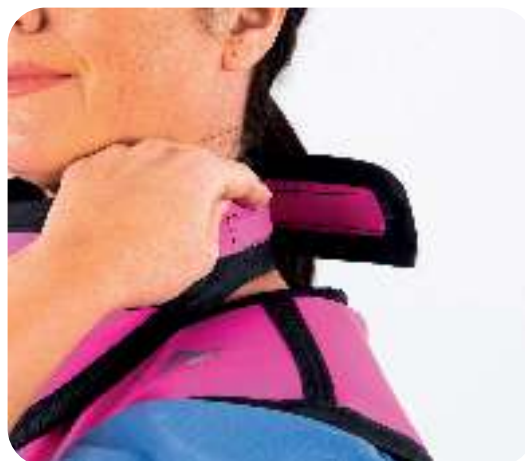
Magnetic Closure Thyroid Collar