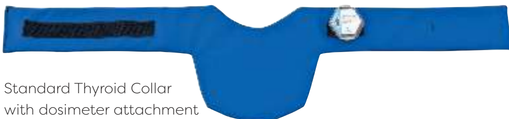
Standard Thyroid Collar with dosimeter attachment