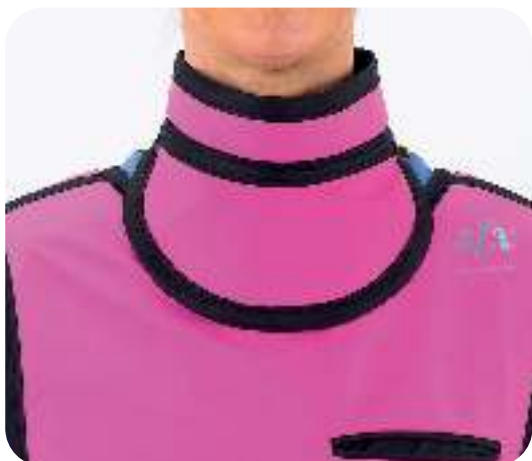
Cap Style Thyroid Collar