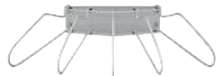
Wall mounted lead Apron Storage Rack with 5 Full Swing Arms