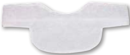
Disposable Thyroid Cover