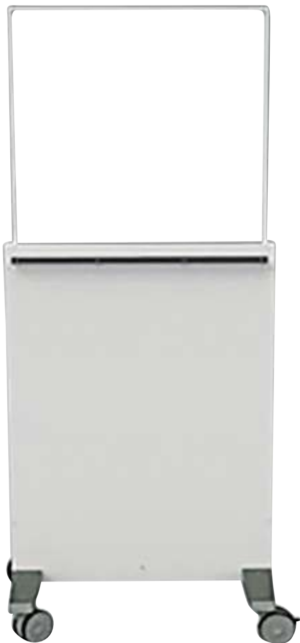
Collapsible Mobile Leaded Barrier