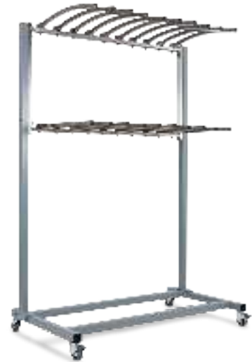
Mobile Dual 10 Arm Apron Rack